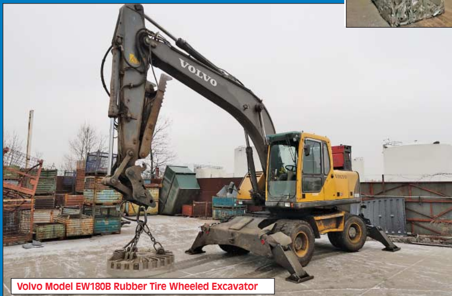
Volvo Model EW180B Rubber Tire Wheeled Excavator