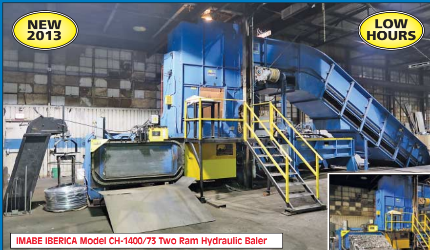
IMABE IBERICA Model CH-1400/73 Two Ram Hydraulic Baler

INSPECTION: MONDAY, FEBRUARY 11TH, FROM 10:00 AM TO 4:00 PM