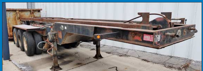
30' Dunrite Tri-Axle Roll-Off Trailer