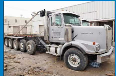
1998 Western Star Model 4964SX Tri-Axle Roll-Off Truck