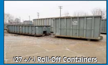
(27 +/-) Roll-Off Containers