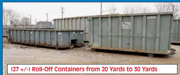
(27 +/-) Roll-Off Containers from 20 Yards to 30 Yards