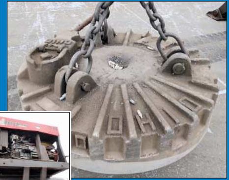
48" Ohio Electro Magnetic Scrap Magnet w/ 13KW Bateman Genset