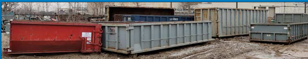
(27 +/-) Roll-Off Containers from 20 Yards to 30 Yards