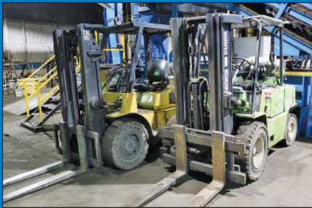
(3) Forklifts to 12,500 Lb. Capacity