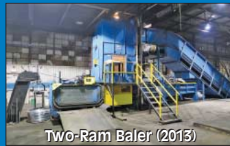
Two-Ram Baler (2013)

Contact Information 2020 Dunlap St. Cincinnati, Ohio 45214 Phone 513-241-9701 Fax 513-241-6760 www.cia-auction.com