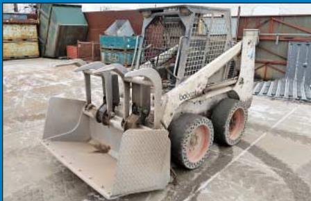
Bobcat Model 753 Solid Tire Skid Steer Loader