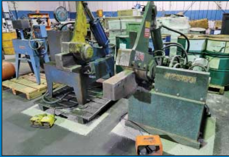
18" and 8" Alligator Shears