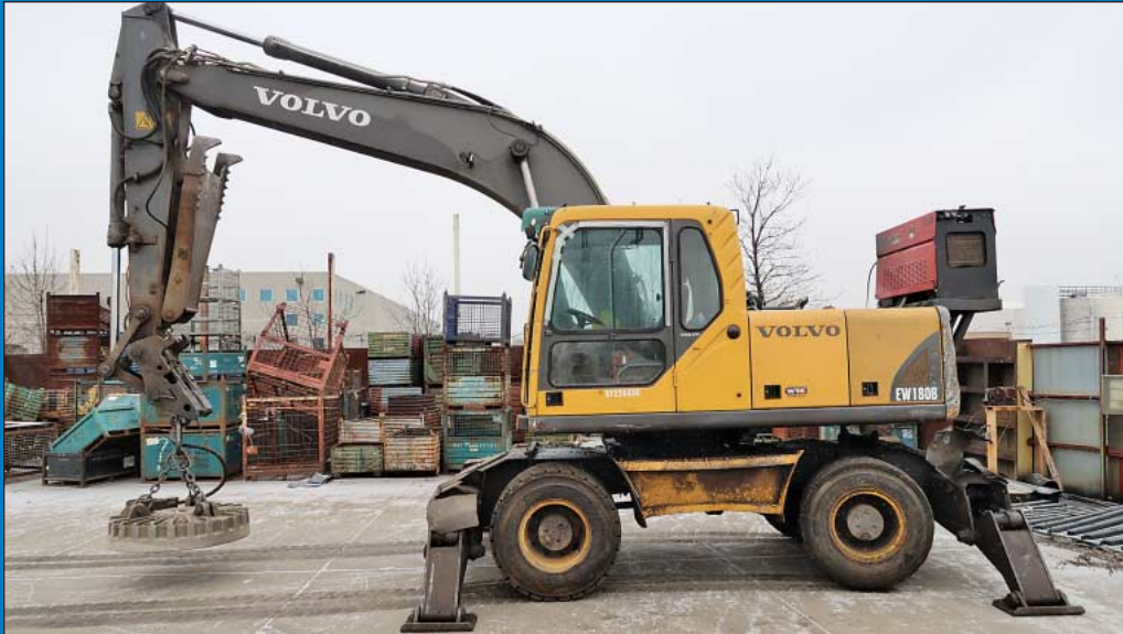
Volvo Model EW180B Rubber Tire Wheeled Excavator