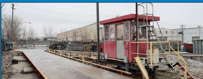
200,000 LB B-TEK Model BT-7211-200-FESD-SL-D Drive On Truck Scale