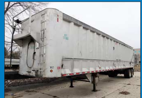
2000 - 42' - 80,000 LB Somerset Model ALF-04 Aluminum Box Walking Floor Trailer

1994 Kenworth Road Tractor; Vin No. 1XKADB9X4SR645287, Aerocab Sleeper Cab, 199,174 Miles Showing, (Miles Over), Muncie Wet Kit