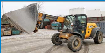
6,000 Lb. JCB Model 527-55 Loadall Telescoping Forklift