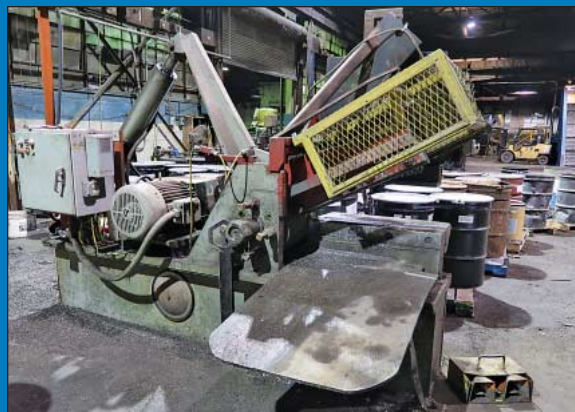
Scrap Processing Equipment Including Alligator Shears to 36"