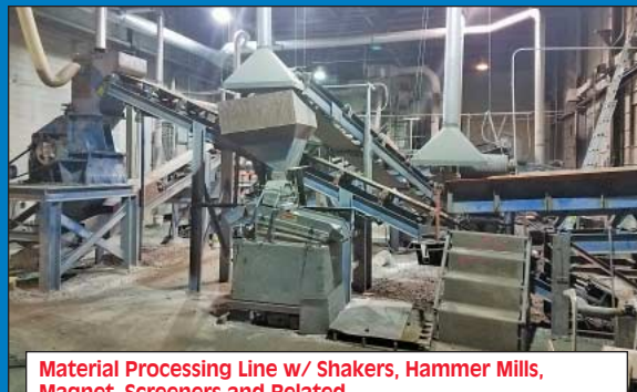
Material Processing Line w/ Shakers, Hammer Mills, Magnet, Screeners and Related