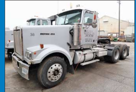
2002 Western Star Model 4900 Road Tractor